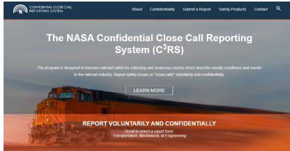
Figure 1. NASA home page for C 3 RS

contributing and causal factors. Based on the factors identified, they recommend corrective actions to share with the participating railroads.